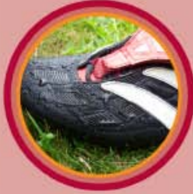
Cleaning & waterproofing for full grain smooth leather footwear Suitable for Gore-Tex® & Sympatex® etc*