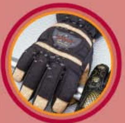
Waterproofing for leather &/or fabric gloves Suitable for Gore-Tex® & Sympatex® etc*