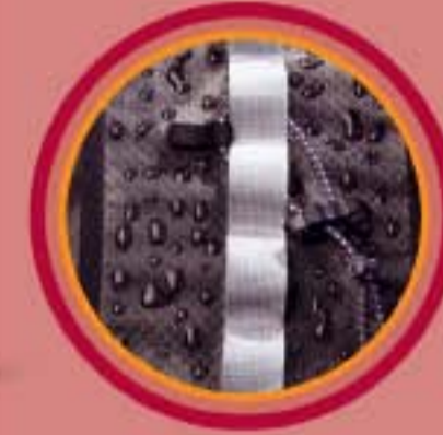
Cleaning & waterproofing for nylon & synthetic tents, clothing & equipment