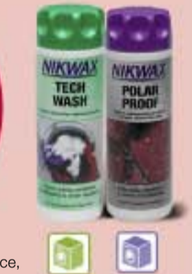
Cleaning & waterproofing for fibre pile, fleece, wool & synthetic insulated clothing