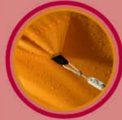
Cleaning & waterproofing with UV blocker for synthetic tents & all exterior weatherproof fabrics