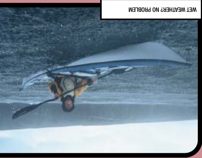
WET WEATHER? NO PROBLEM