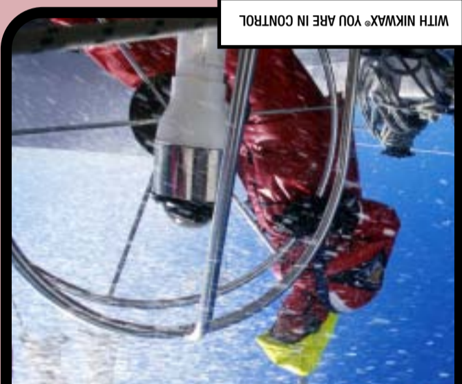
WITH NIKWAX® YOU ARE IN CONTROL