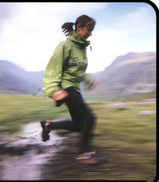
YOUR SOLUTION TO SPORTS IN WET WEATHER