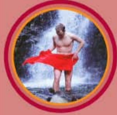
The ultimate, light weight & fast drying towel. Suitable for any sports